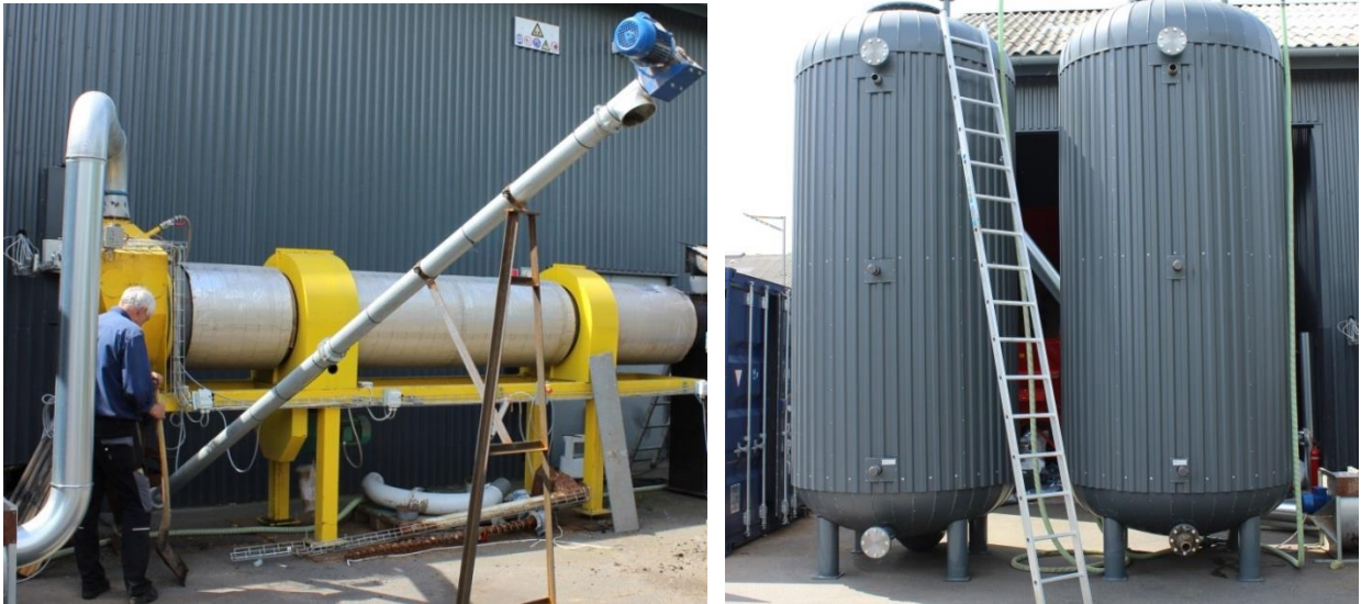
Figure 3. Left photo: The biomass dryer. The warm outlet air is led to the N-strippers via the bended pipe seen in the left side of the biomass dryer. Right photo: The two N-strippers.

Figure 3 shows two photos from the test set up at the biogas plant. The left photo shows the biomass dryer and the right photo shows the two N-strippers.