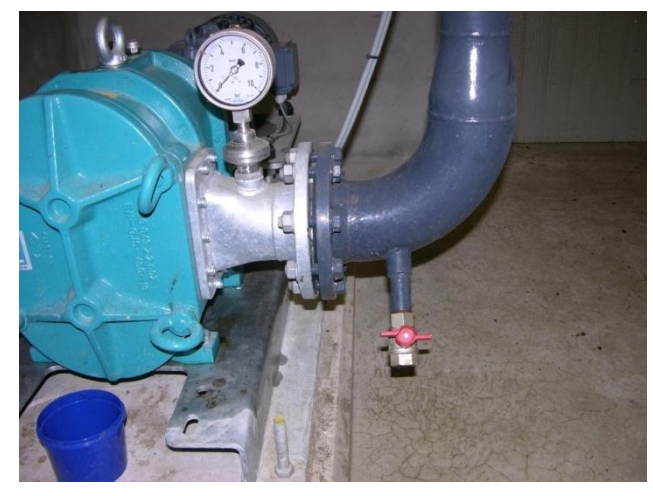
Figure 4. Tap for taking samples of input digested biomass.

Sub-samples of liquid output fraction were taken from a tap under the decanter. This tap is built on the decanter at the factory and it is constructed to take representatives samples of the liquid output fraction. A photo of the tap is seen on figure 5.