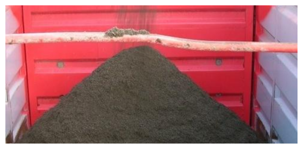
Figure 6. Collection of solid fraction in container.