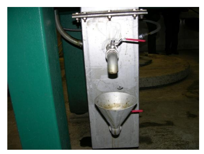
Figure 5. Tap for taking samples of liquid output.

Sub-samples of liquid output fraction were taken from a tap under the decanter. This tap is built on the decanter at the factory and it is constructed to take representatives samples of the liquid output fraction. A photo of the tap is seen on figure 5.