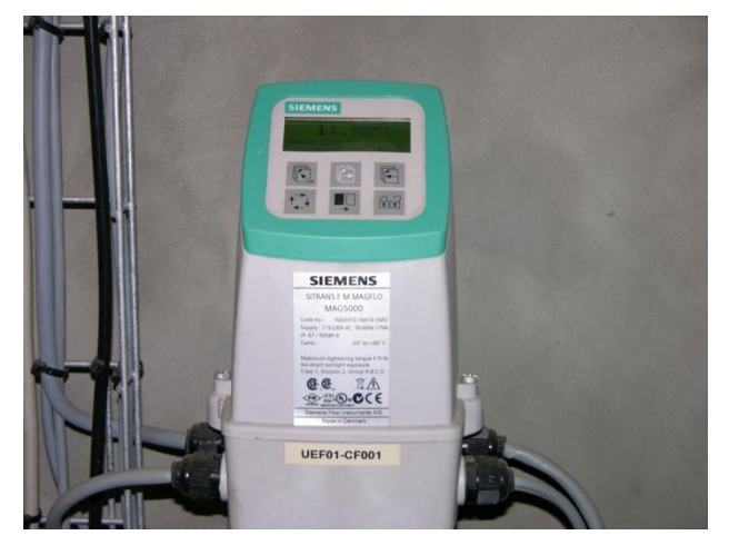
Figure 3. Flowmeter measuring amount of treated biomass.

A flowmeter was installed at the inlet to the decanter when the decanter was installed. It is a Siemens MAG5000 constructed for measuring in matrices like slurry. It was calibrated when it was installed. A photo of the flowmeter is seen in figure 3.