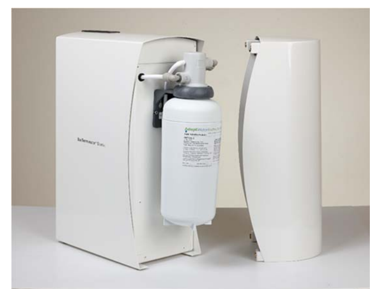
Figure 1: The BacTerminator<sup>®</sup> Dental